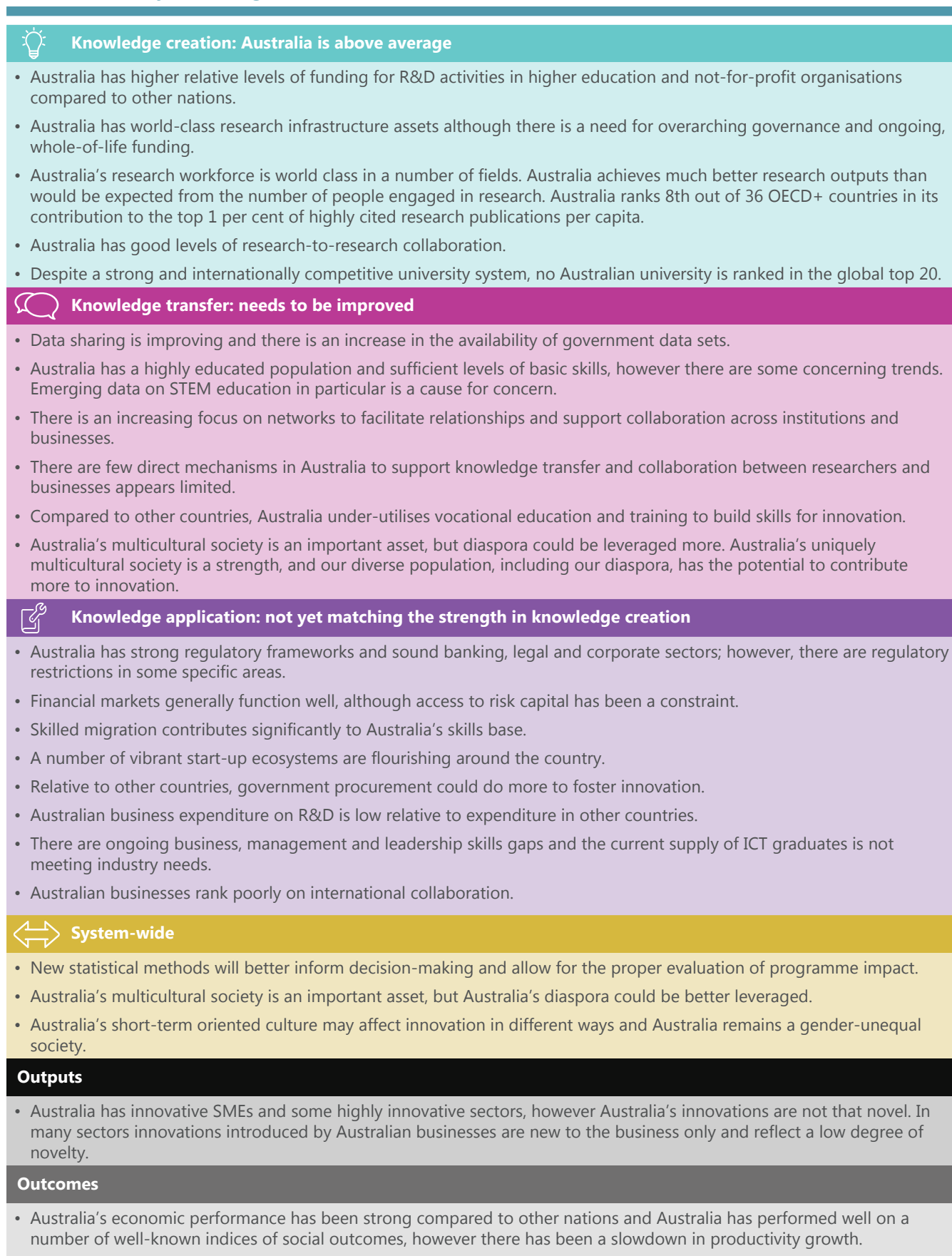
Table 1. Summary of Findings from the ISR Review

The ISR System Review makes findings on the performance of the Australian Innovation, Science and Research System (Table 1). It aims to identify aspects of the ISR System needing greater effort, and to propose metrics that can be used to track the performance of the ISR System over time.